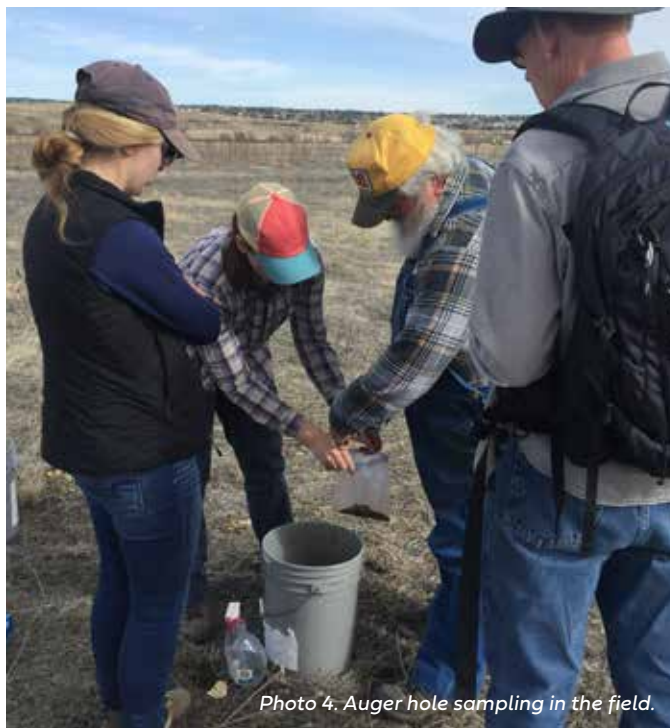
Photo 4. Auger hole sampling in the field.