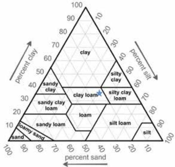
Figure 4. USDA Soil Triangle (Soil Texture Calculator).