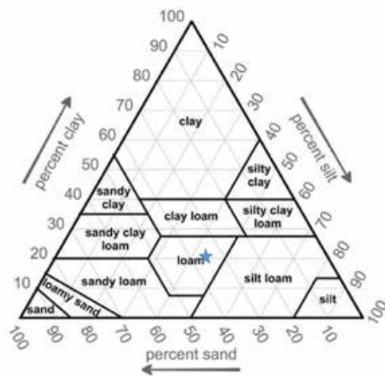
Figure 1. USDA Soil Triangle (Soil Texture Calculator).