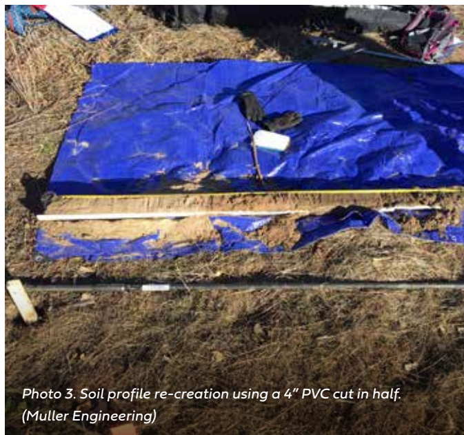
Photo 3. Soil profile re-creation using a 4" PVC cut in half.

Augering depth: To assess surface soils for suitability as a growing medium, auger to a depth of at least 2 feet, going deeper if needed to penetrate 6 inches into the underlying subsoil (distinct from topsoil). Use this to identify if soils under the organic layer can be used to supplement topsoil (with some amendment) and determine if the subsoil is suitable for the root zone or if problematic issues such as high salinity are present. Auger deeper if needed to supplement information on the water table (in the absence of or to supplement geotechnical borings). A helpful technique is to lay cores of soil material in a section of half-round 4" PVC to recreate and photograph the soil profile (Photo 3). Photographs help document clear transitions between color, soil structure, or soil texture and separate soil samples by the horizon.