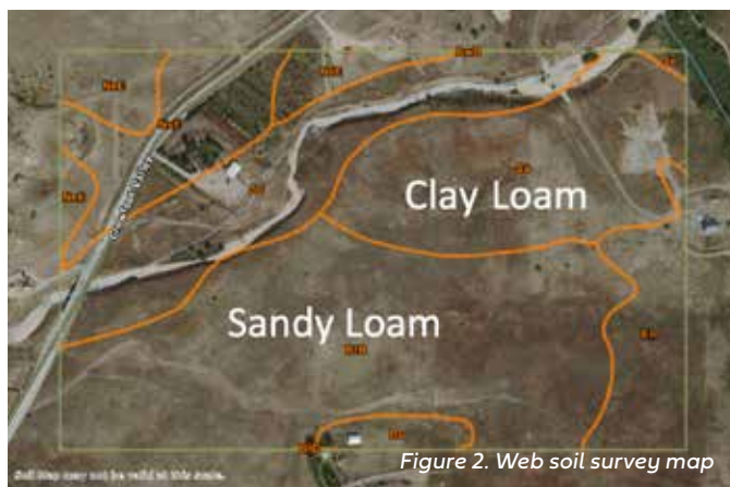
Figure 2. Web soil survey map

The results indicated that minimal amendments were needed for this source of topsoil. The plan to strip topsoil from the adjacent development area and place it within the stream project area would help create more stable floodplain benches and stream banks. Even though the texture of the topsoil in the development area was rated suitable (rather than ideal) in the parameter table, the clay loam topsoil is better suited than sandy loam or loam for resisting water erosion due to its greater cohesive strength. This is noted in the footnotes of Table 2.