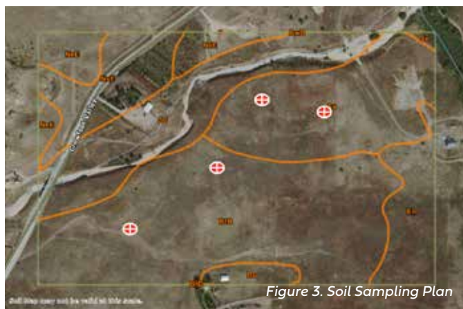
Figure 3. Soil Sampling Plan