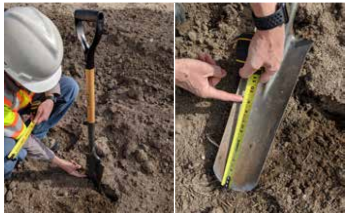
Photo 5. Depth of topsoil placement verification in the field.

In a preconstruction meeting that included the engineer, the contractor for the stream project, and the contractor for the development, the group discussed the intent of the topsoil plan and identified appropriate contacts. During construction, several site visits were made to conduct the observations identified in the guidance document, including verifying that the correct areas and depths of topsoil were stripped and placed appropriately (Photo 5).