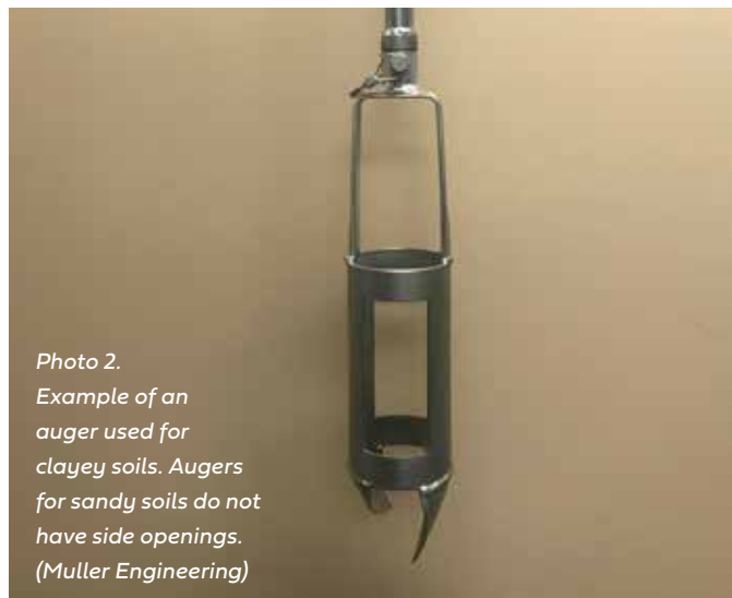
Photo 2. Example of an auger used for clayey soils. Augers for sandy soils do not have side openings.

Besides providing a means to visually observe the soils, the purpose of augering is to gather samples for laboratory analysis of parameters listed in Table 1. Although skilled practitioners may be able to determine soil texture in the field by sight and feel, a soil particle size analysis (by laboratory analysis) will confirm the soil textural class (e.g., sandy loam, loam, etc) based on plotting the percent sand, silt, and clay on a US Department of Agriculture (USDA) soil triangle, discussed in the following section.