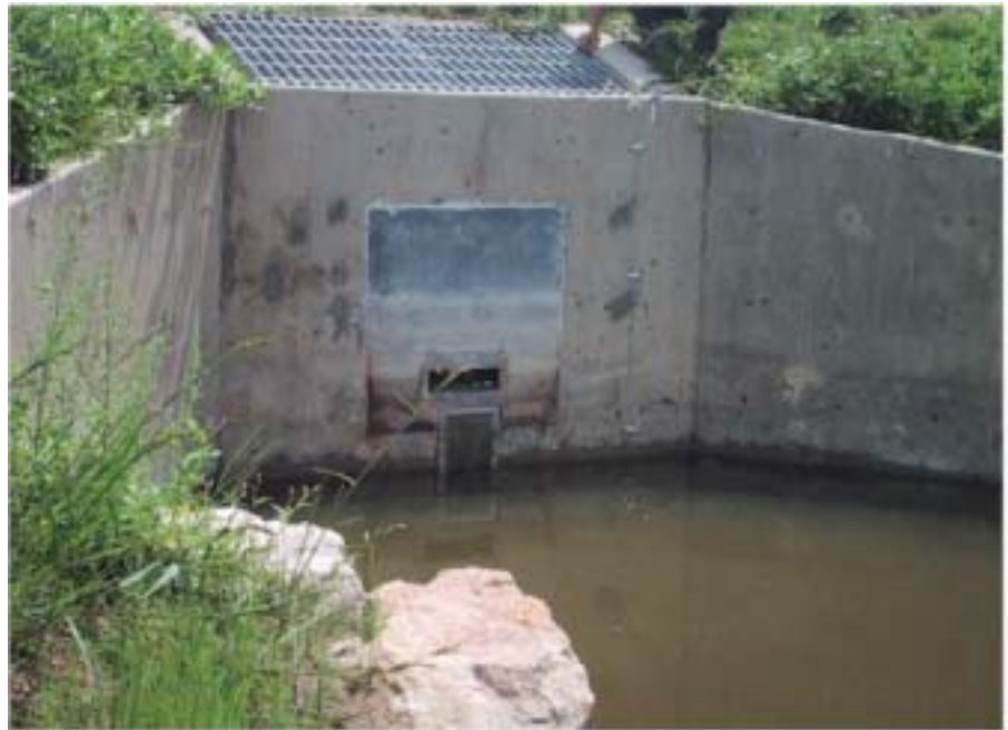
Figure 1. Extended detention outlet installed June 2001 in operation in August - 18 hours after storm's end. Note the partially submerged well-screen type trash rack, the debris line that is near the bottom of the 10-year control orifice and the 100-year overflow on top.

The universal use of BMPs can be very expensive. Many BMPs require the dedicated use of expensive land areas, and their ongoing operation and maintenance have a significant price tag. If the selected BMPs provide a level of protection for the receiving waters, the price may be worth it. However, if they do not, then much money is being spent building facilities for naught. The only way to answer whether what we are installing and maintaining in our communities is effective is to have the Federal Government, states, and local jurisdictions commit to a long-term national program of basic research. The research being suggested would help quantify the linkages between urban stormwater BMPs and their ability to mitigate the impacts of urbanization on receiving waters.