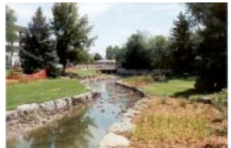
DeBoer Park low flow channel before and after.