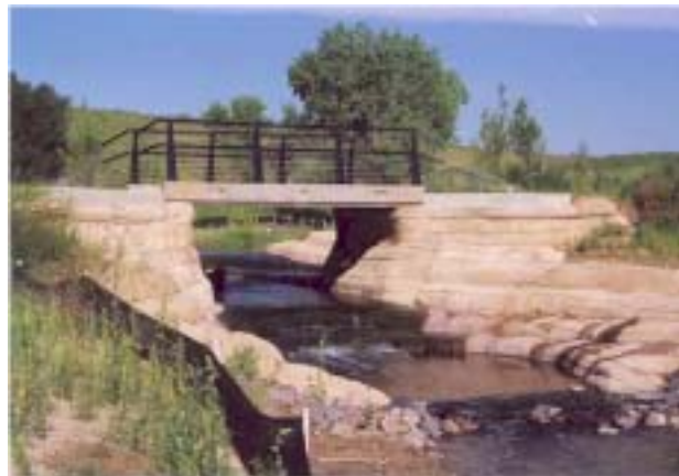
Two of the Grange Hall Creek sculpted structures.

Design was initiated in 1997 and construction was completed in 2000.