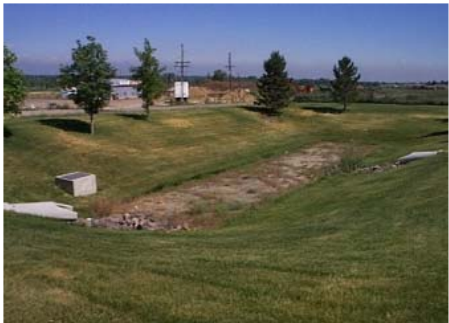
Figure 2. Sand filter with water quality capture volume above it, installed late 1980s. Note two inlet pipes and an overflow for larger storms. Volumes below the overflow are filtered and, because site conditions permit, infiltrated into the ground.

To assist with these research needs, the Water Environment Research Foundation has launched a stormwater research program. It will fund this effort by seeking Federal and other grants and through subscriptions by municipalities