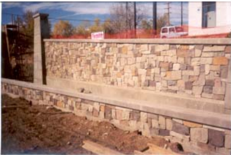
Goose Creek form liner detail.

structures constructed along Grange Hall Creek and its North Tributary. These two and four foot drops were constructed of concrete utilizing a reinforced concrete substructure with a colored shotcrete covering. After application of the shotcrete, the finished surface was sculpted to give the appearance of a rock outcrop. These “feaux” rock structures have been getting considerable attention in the metropolitan area and we anticipate using them on other projects. The Grange Hall Creek Project received the Grand Award at this year’s Annual Conference of the Colorado Association of Stormwater and Floodplain Managers. Congratulations to the City of Northglenn and Muller Engineering for their fine work on this project.