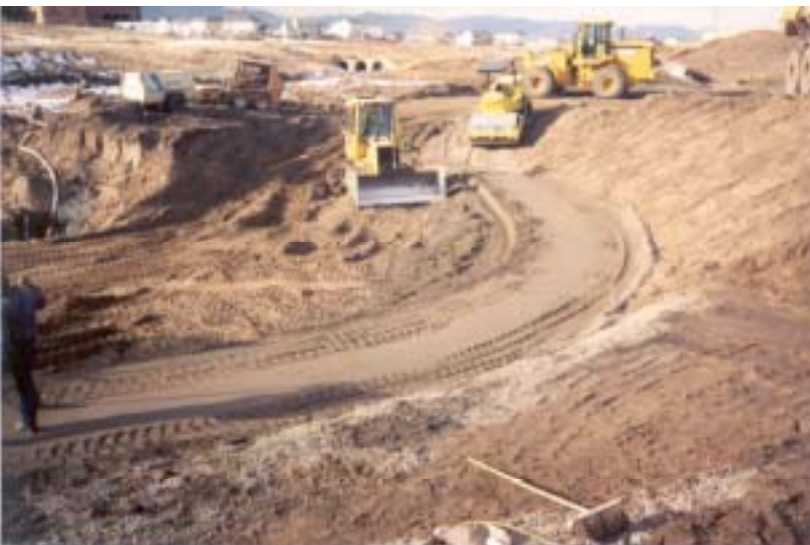
Constructing a soil cement drop structure on Marcy Gulch.

Yet another phase of Goose Creek in the City of Boulder was completed this past year. Unique to this project was the use of a very intricate form liner, which gives the appearance of a rock wall. Coloration was added to the individual “concrete” rocks to enhance the appearance of the wall. The final phase of the Goose Creek channel improvements was bid by the City of Boulder in late 2001 and should be starting early in 2002. This will conclude a multi-year multi-phase project that was initiated in the mid-1980s. The resultant 100-year channel improvements will remove a number of properties from the floodplain.