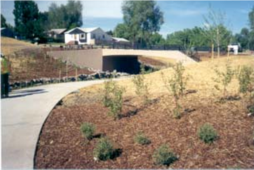
Looking upstream at the new Perry Street bridge along Lakewood Gulch.

structures constructed along Grange Hall Creek and its North Tributary. These two and four foot drops were constructed of concrete utilizing a reinforced concrete substructure with a colored shotcrete covering. After application of the shotcrete, the finished surface was sculpted to give the appearance of a rock outcrop. These “feaux” rock structures have been getting considerable attention in the metropolitan area and we anticipate using them on other projects. The Grange Hall Creek Project received the Grand Award at this year’s Annual Conference of the Colorado Association of Stormwater and Floodplain Managers. Congratulations to the City of Northglenn and Muller Engineering for their fine work on this project.