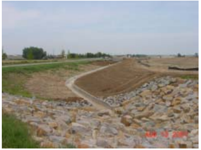
Two views of the Wadley South Channel at The Haven at York

acceptance). FEMA issued the LOMR on September 25, 2001. We think that's remarkable considering the national disaster and attendant upheaval that occurred during the review period.