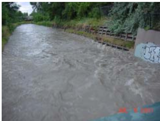
Goldsmith Gulch upstream of Mexico Avenue on July 8, 2001. Many more during and after photographs can be seen on the District's web page at udfcd.org .

A more comprehensive version of the above article can be found at udfcd.org . The web page contains related photos, figures, links and other information that could not be included in this printed edition of Flood Hazard News due to space limitations. One link to check out is the PowerPoint™ presentation of the July 8 flood that was presented by Bill DeGroot at the 2001 CASFM conference in Steamboat Springs.