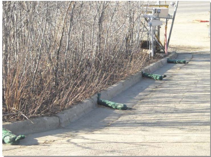
Photograph RS-1. Rock socks placed at regular intervals in a curb line can help reduce sediment loading to storm sewer inlets. Rock socks can also be used as perimeter controls.

A rock sock is constructed of gravel that has been wrapped by wire mesh or a geotextile to form an elongated cylindrical filter. Rock socks are typically used either as a perimeter control or as part of inlet protection. When placed at angles in the curb line, rock socks are typically referred to as curb socks. Rock socks are intended to trap sediment from stormwater runoff that flows onto roadways as a result of construction activities.