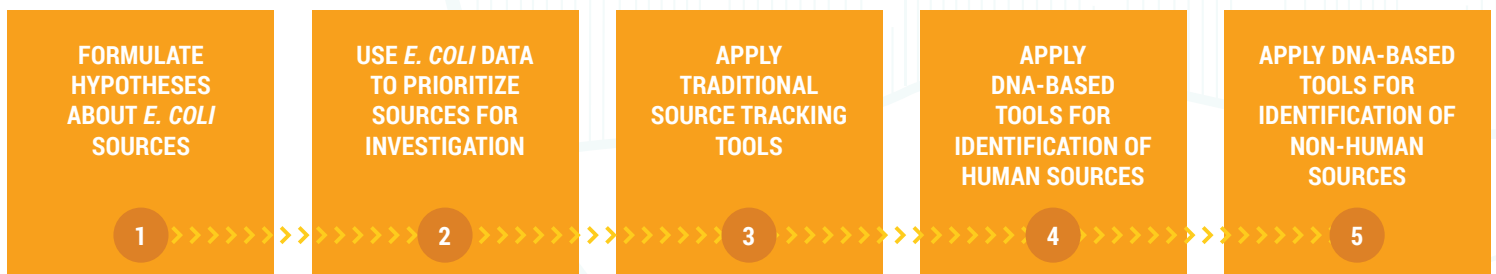
FIGURE 1. TIERED APPROACH TO SOURCE TRACKING (ADAPTED FROM GRIFFITH, 2013)